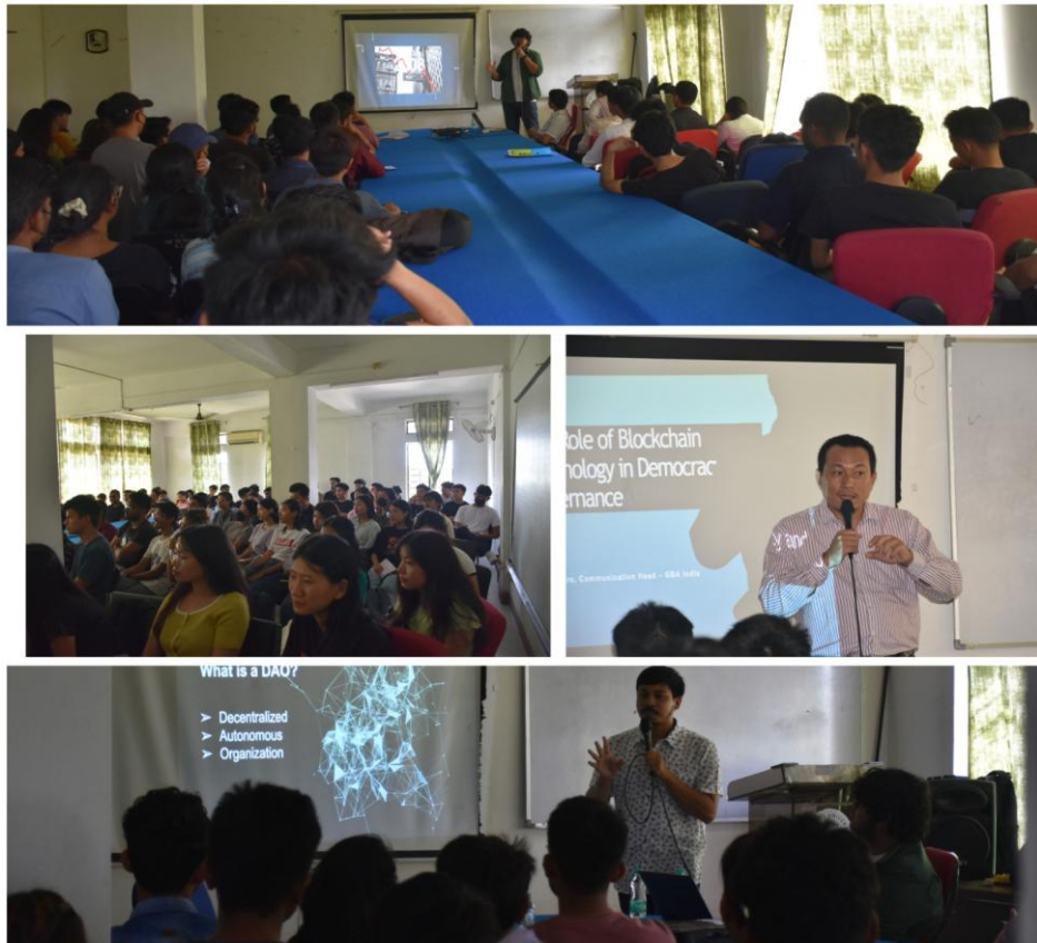
3rd International Conference on Biologically Inspired Techniques in Many-Criteria Decision-Making (BITMDM-2024) Technologies organized by School of Engineering & Technology, Nagaland University held during Dec. 6-7, 2024 (Proceeding published in Springer).