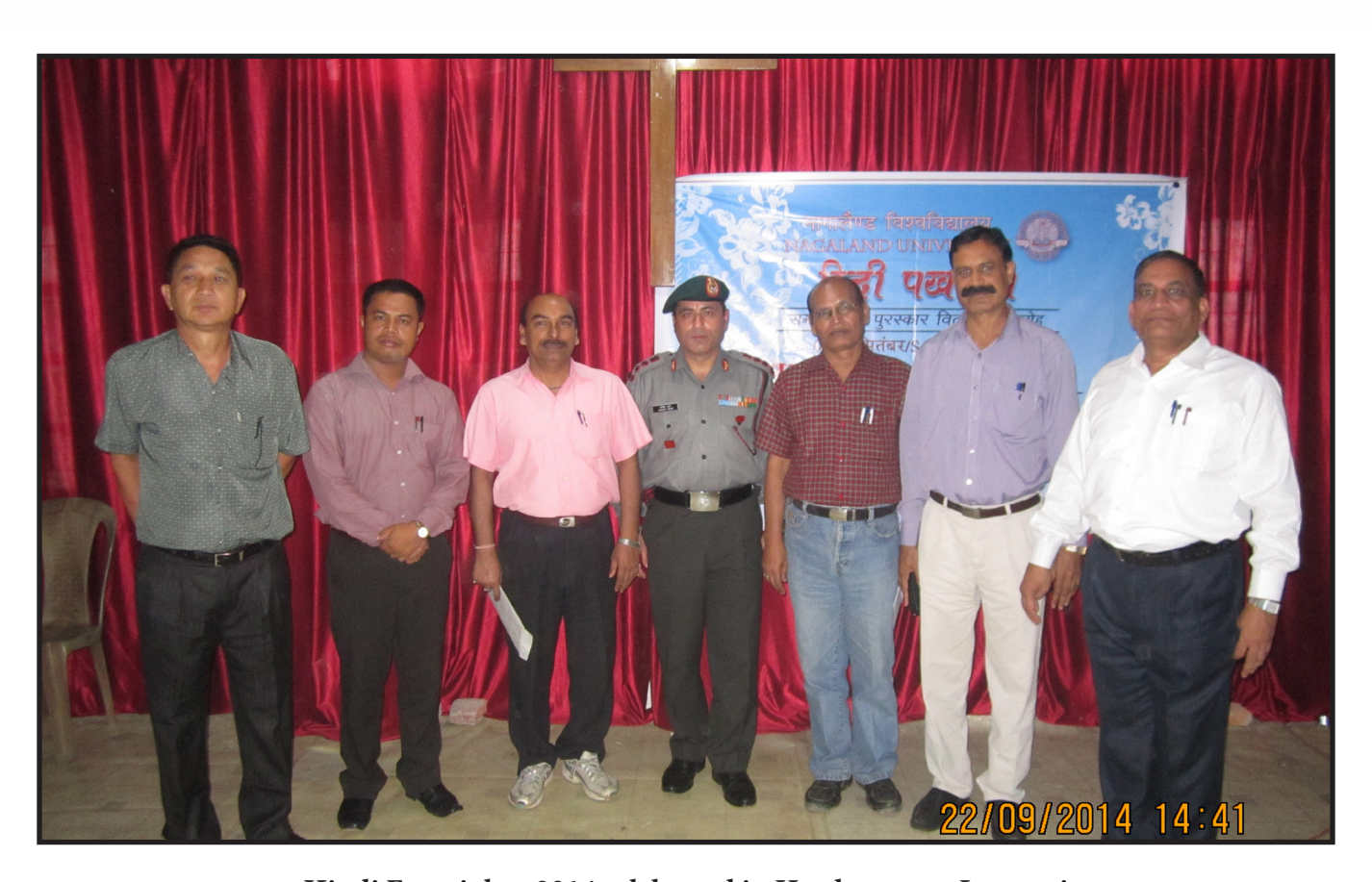
Hindi Fortnight - 2014 celebrated in Headquaters : Lumami