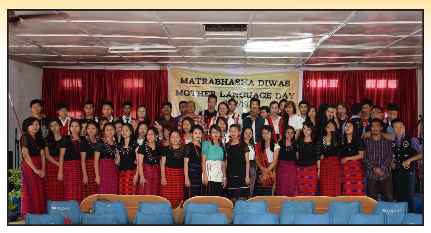
Mother Language Day (Matrabhasha Diwas) - 2014 Lumami Campus