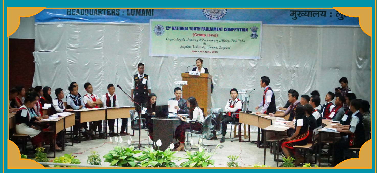
12th National Youth Parliament Competition