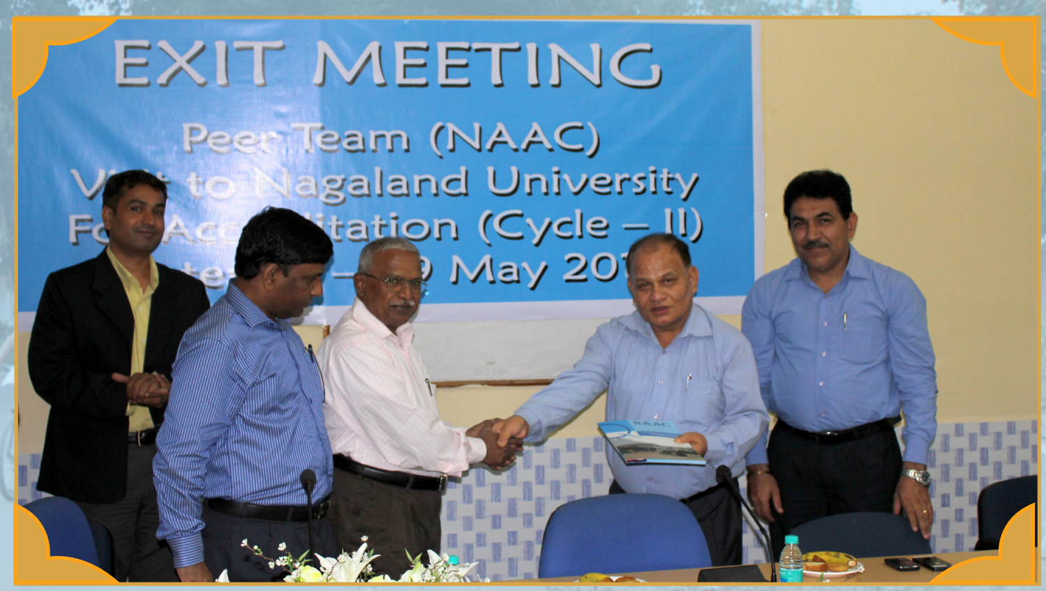
20TH ANNUAL REPORT 2014-15