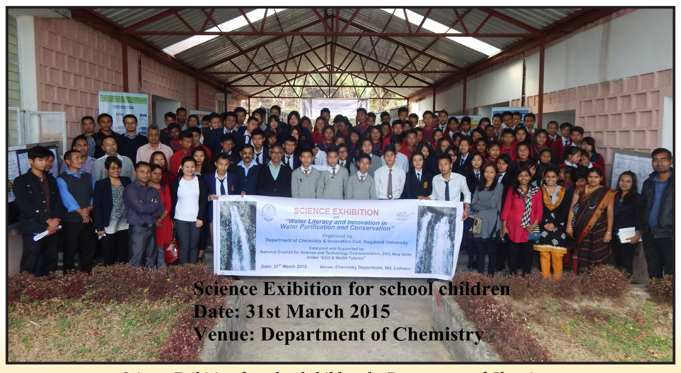
Science Exibition for school children by Department of Chemistry