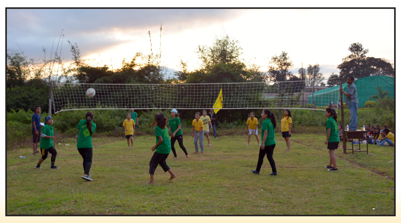
Students participating in sports events 2014 SASRD Medziphema Campus