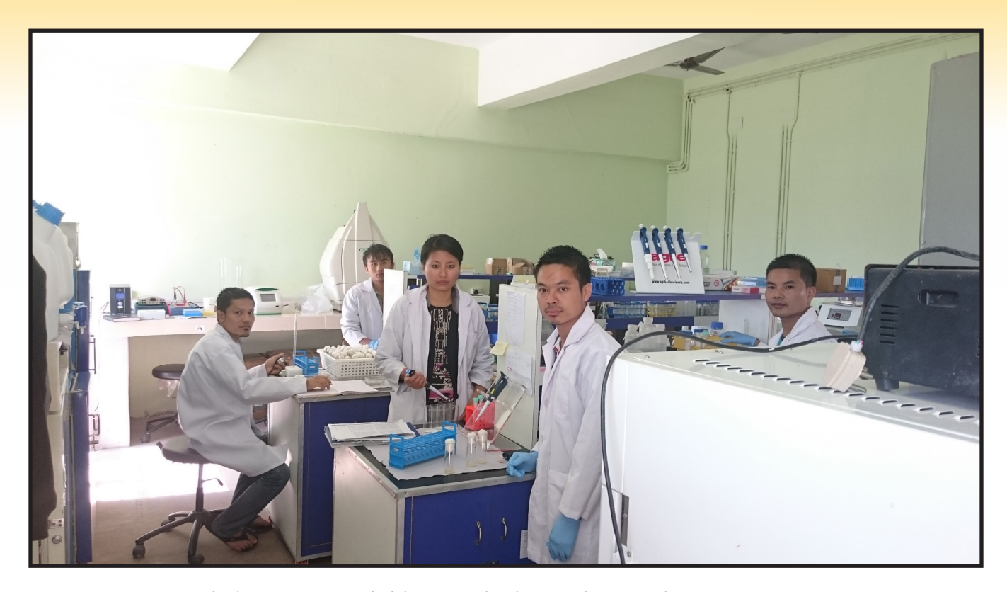
Scholars in Drosophilila Neurobiology Lab in Zoology Department