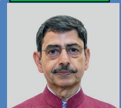
Shri. R. N. Ravi Hon'ble Governor of Nagaland & Chief Rector of Nagaland University

Jointly Organized by Department of Education & Department of Teacher Education Nagaland University